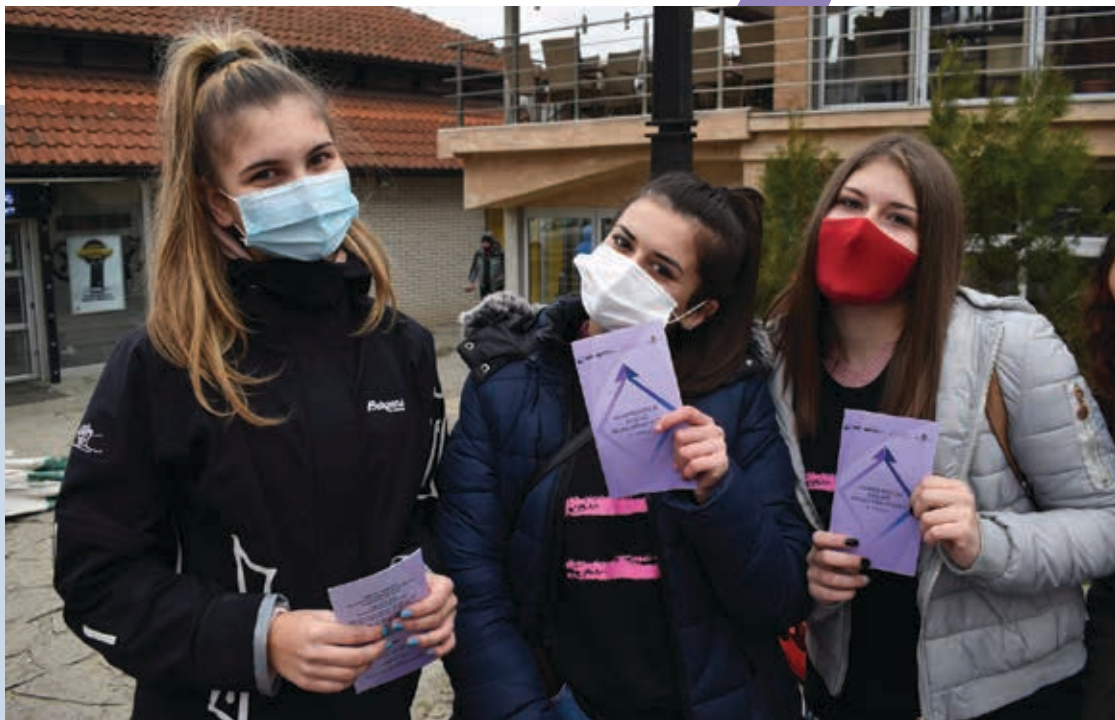
Gender equality improvement

The project is being implemented by the Ana and Vlade Divac Foundation and the Center for Democracy Foundation under the auspices of the Balkan Trust for Democracy and the Embassy of the Kingdom of Norway. The project is aimed at increasing awareness and knowledge of Chapter 23 and the process of further alignment with EU Acquis on the position of women in Serbia and working rights in order to achieve gender equality.