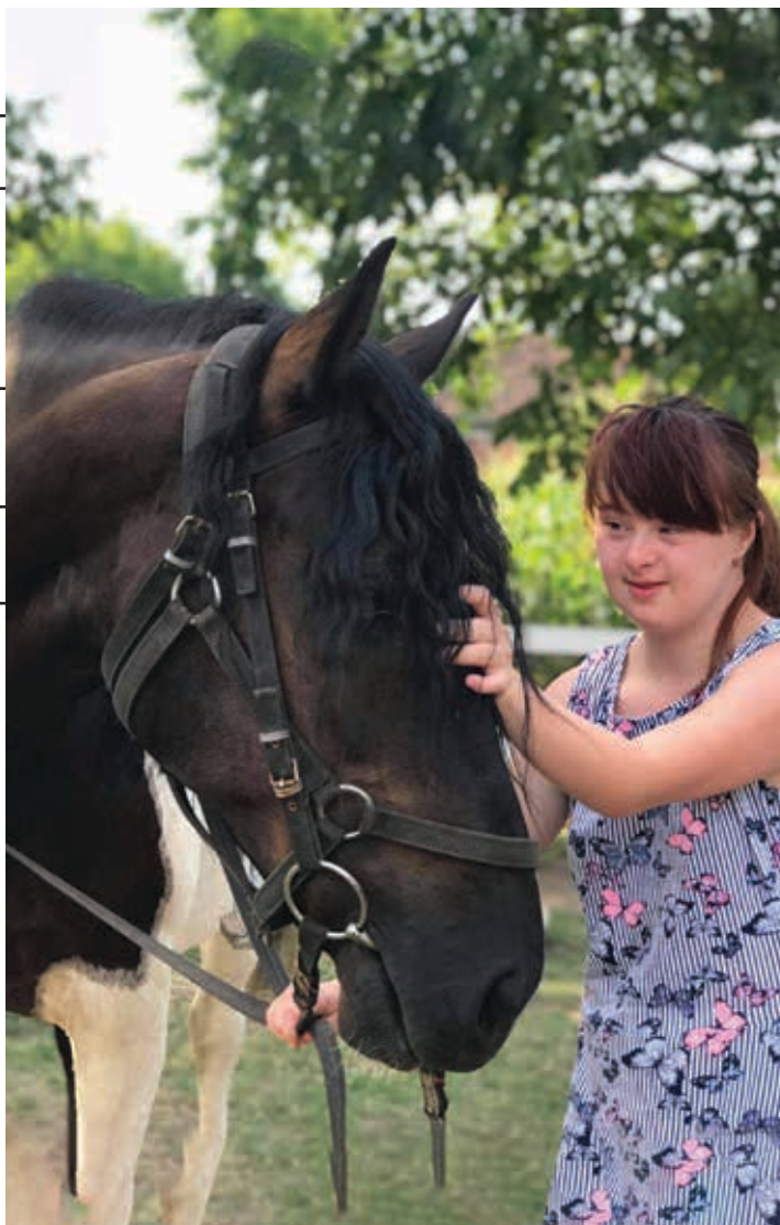
UCitizens' association of horse lovers of West Bačka, Sombor, workshop

In December 2020 an online Solidarity Festival was organized to involve all the organizations from the project, local associations and interested residents. As part of the Festival, MNRO from Šid also additionally organized an eco-workshop with its beneficiaries, the Sombor Red Cross organized a first aid demonstration, and cotton face-masks and other materials were distributed to the Festival participants.