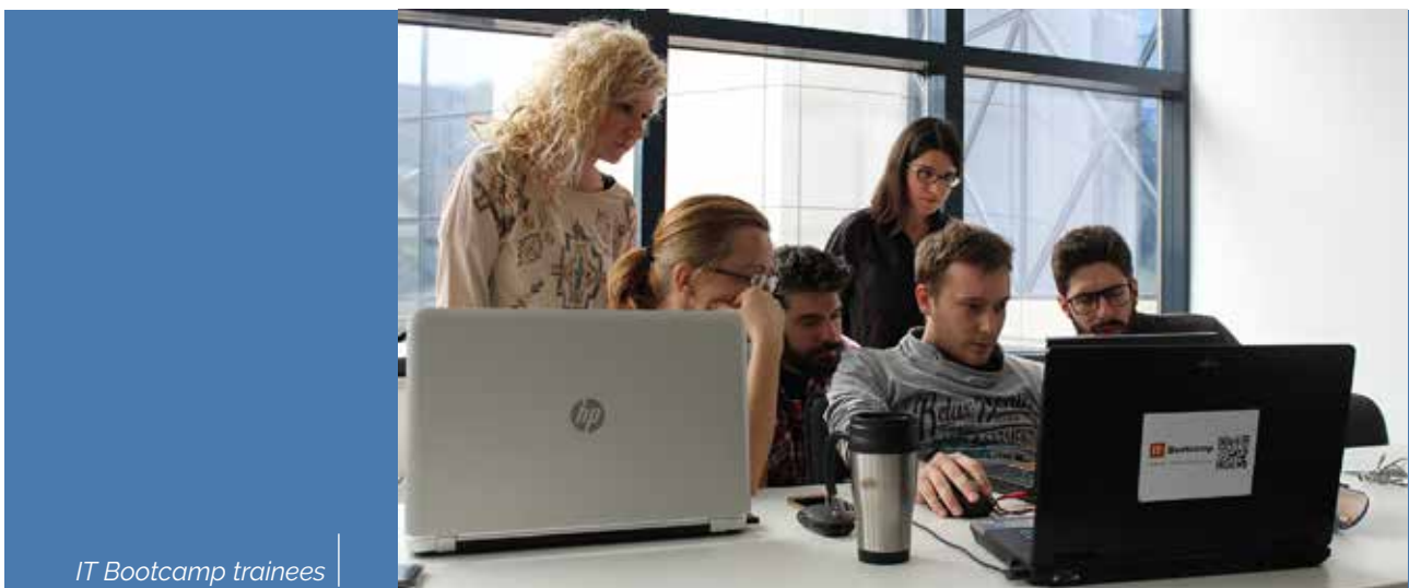
IT Bootcamp trainees

IT Bootcamp is a non-profit, free of charge school for retraining people from other sectors for jobs in IT sector. The school started working in Belgrade in 2018. It was established by diaspora donors and is functioning in strategic cooperation with the Ana and Vlade Divac Foundation. In 2019 the school expanded to the city of Niš, and in 2020 to Novi Sad and Kosovo and Metohija. The courses offered by the school are created for motivated individuals who want to change their career paths and enter the IT sector, which is the fastest growing sector both in our country and the world. Enrollment includes quite a serious selection process consisting of several phases of testing logical thinking, candidate's readiness to learn as well as his/her motivation and perseverance. The best candidates get a chance for free schooling, but the selection continues during schooling. The candidates who fail to meet their obligations in time and fail to show an adequate level of knowledge in tests cannot complete the school program.