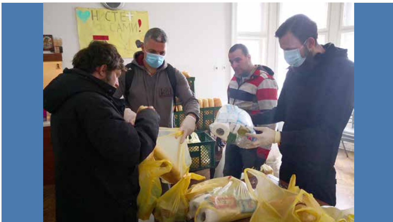
Church soup kitchen

Immediately after the state of emergency had been declared in Serbia, the Foundation turned all its forces and capacities towards urgent provision of humanitarian aid to the most vulnerable citizens, local communities, civil society organizations and institutions..