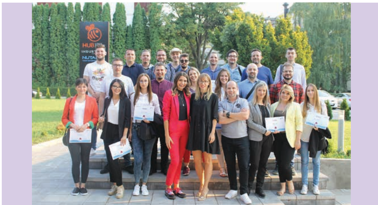
Diploma awarding ceremony to successful trainees of IT Bootcamp

We are proud of the school's work up to now and are looking forward to having future generations. Thank you all for helping us make good results. We hope you will be with us in the future too.