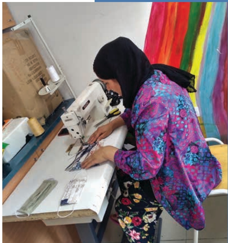
Krnjača reception center, sewing masks for the users of center facilities and for other local associations and their users

The project was organized with the support of Open Society Foundations.