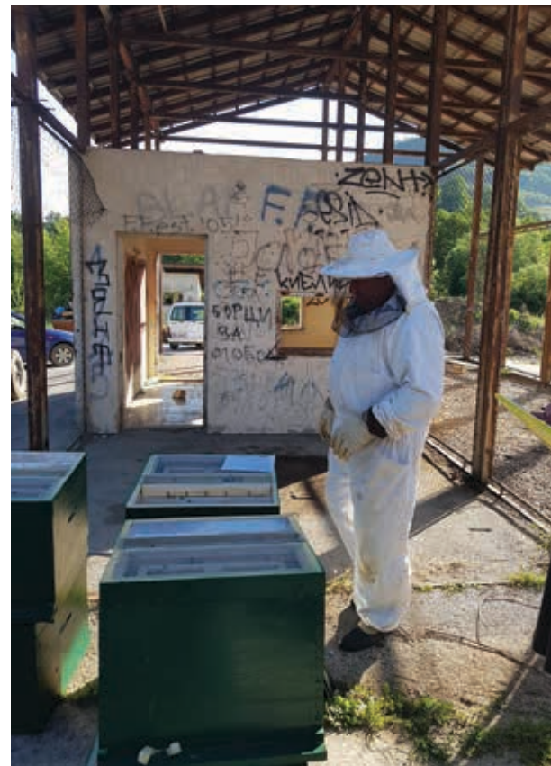
Užice, handling beehives