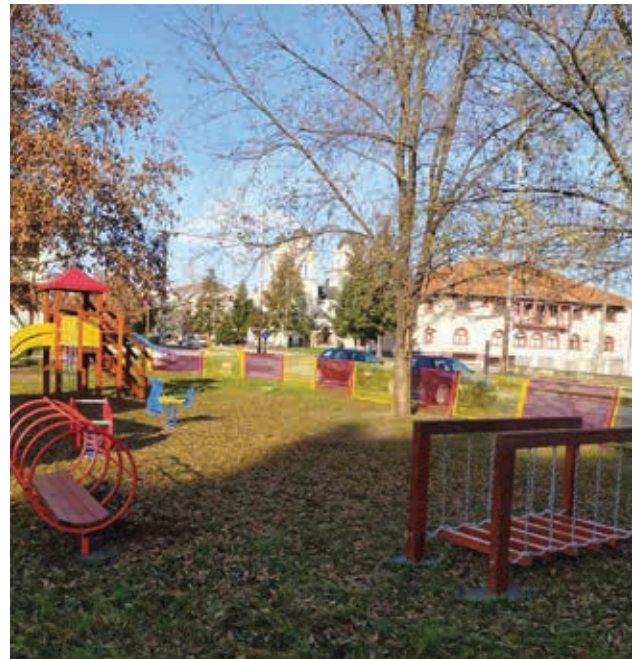
Kindergarten in Smederevska Palanka

Each of the kindergartens received the playground articles in order that the children be provided with better conditions for safe playing in the open.