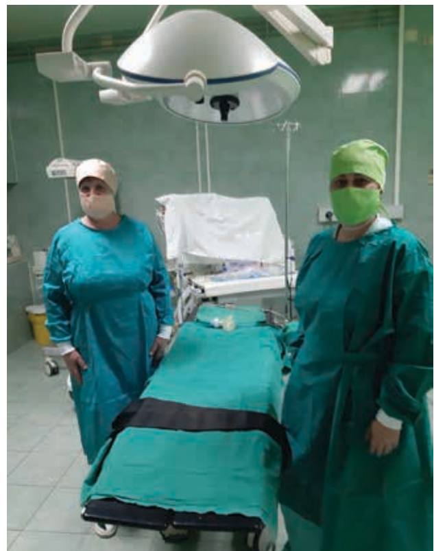
Obstetrics and gynecology clinic in Prokuplje

For every pack of Pampers diapers bought at Lilly stores from April to June 2020, a donation was made to maternity hospitals in Belgrade, Kragujevac and Prokuplje — a total of 10,000 euros was donated. Every maternity hospital got the equipment they needed most. Obstetrics and gynecology clinic Narodni front in Belgrade is now richer for hand washing units, air conditioning units and other useful equipment. Obstetrics and gynecology clinic in Kragujevac needed air conditioning most, while the Obstetrics and gynecology clinic in Prokuplje strove to meet the needs of new moms at their hospital, which is why the donation was used to create a nicer and more pleasant environment for pregnant women's and nursing mothers' accommodation and stay at the clinic.