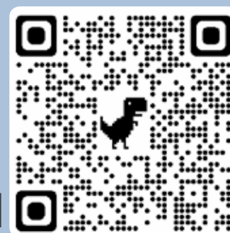
QR kod, Muzej filantropije

During the Festival and through 10 educational videos, the visitors were virtually acquainted with Serbian endowments and endowers, such as Galerija Matice srpske and Ilija Kolarac Foundation. On the last day of the Festival, citizens were invited to engage in humanitarian action by selecting the activity they want to support thus contributing individually to making the culture of giving our habit. The Festival closed with performances for children of the Kotor Festival of Theaters for Children "How great people grow" and the Puls Theater from Lazarevac "Marko Kraljevic and Musa Kesedžija".