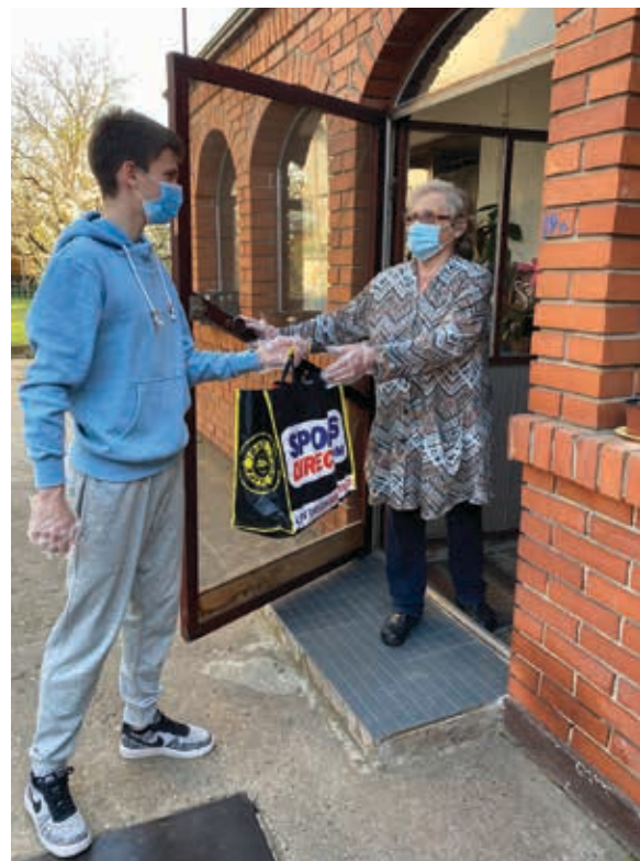
Divac scholarship holder, volunteer

Every day the holders of scholarships awarded by the Ana and Vlade Divac Foundation, who volunteer every month for at least four hours, send their volunteer stories that they no longer measure by the hours invested in this activity, but by the gratitude of those whom they help. Young people, who are themselves from families in need of support, are helping the elderly citizens in different ways, giving free online classes to their peers, volunteering at the Red Cross, and some of them, with their families, sewn up protective masks for their fellow citizens.