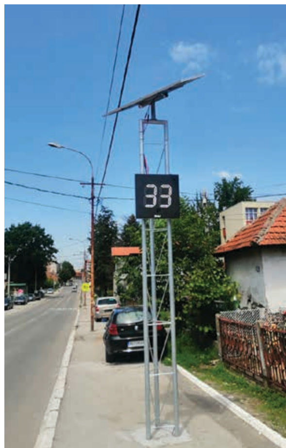
Speedometer in Mladenovac